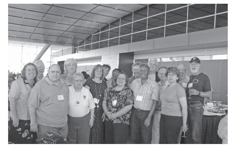
Council delegates at COPE reception