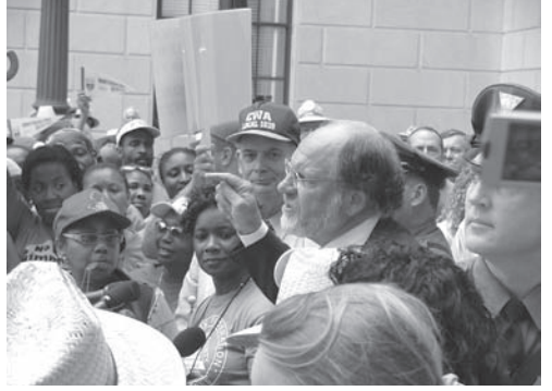
Governor Corzine addresses the rally

n a very hot and humid day, approximately ten thousand state and local government employees rallied in Trenton on June 19 in front of the State House Annex in support of Governor Jon Corzine's proposed budget, in particular, its $1.1 billion contribution to State pension plans. As a single engine plane circulated overhead trailing a banner urging support of the Governor's budget, diverse union leaders and State legislators from both parties proclaimed the importance of retirement security and the sanctity of the collective bargaining process. The theme throughout the rally was a deal is a deal!