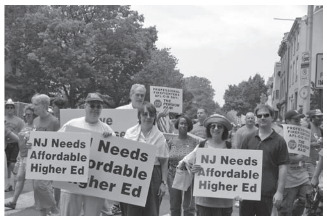
MSU Local 1904 delegation

Rally speakers responded to calls by a few Democratic State legislators for state employee unions to accept a 15% cut in their salaries and benefits mid-term in their contracts. They em-